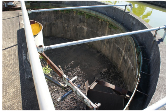
Figure 28. Interior view of sedimentation tank.