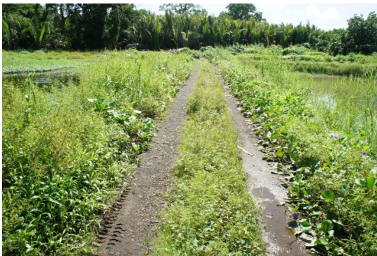
Figure 11. Road separating first (left) and second (right) oxidation ponds.