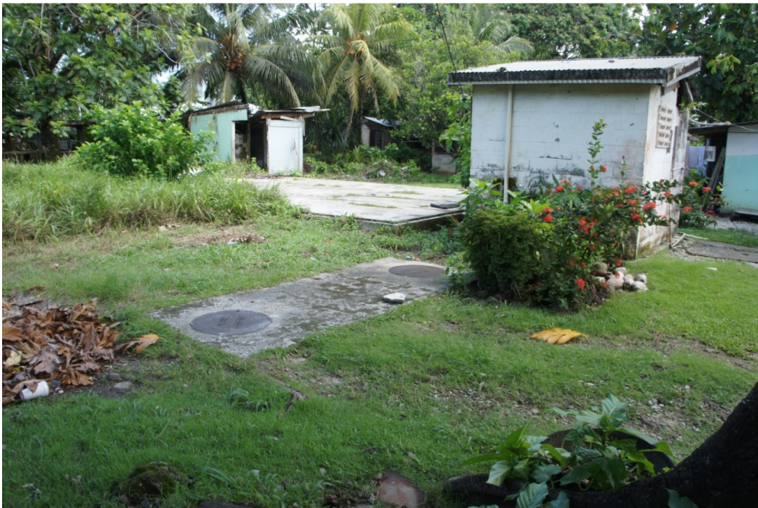
Figure 3. Typical outhouse with adjoining septic tank in Lelu Village, Kosrae.

A solid-waste landfill (Fukuoka type—a semi-aerobic landfill technology) was installed on Kosrae in 2010, which includes a leachate collection system. While the landfill, per se, would not be a part of this study, the leachate generated at the landfill would be of concern as an industrial wastewater. The leachate flow is mostly a function of the amount of rainfall over the exposed landfill and is collected in a catch pond with an impervious lining (see Figure 4). Out-flow from the pond passes through a gravel-sand bed and is discharged into the coastal mangrove. The leachate is tested for chemical oxidation demand (COD – an aggregate indicator of organic compounds) and pH on a monthly basis with each testing event consisting of multiple measurements taken directly from the leachate and nearby environmental samples. Test results have consistently been below the regulatory limits of 100 mg COD/l and pH of 10, which can be attributed to diligent segregation of waste materials prior to deposition. In the event of an effluent quality violation, the public must be alerted to avoid the discharge area. If discharge quality does become an issue in the future, some form of engineered treatment process would have to be considered.