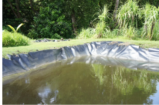
Figure 10. Leachate collection pond at landfill.