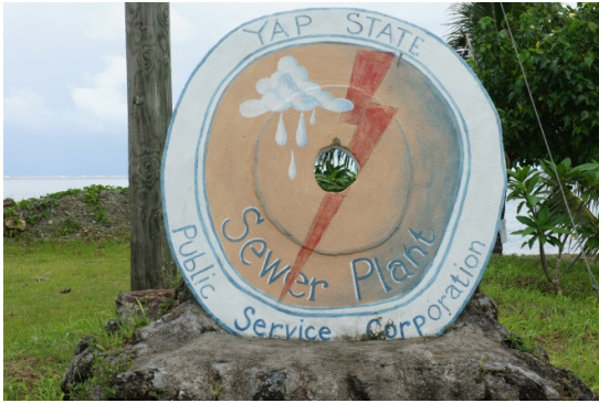
Figure 33. Entrance to wastewater plant in Yap State.