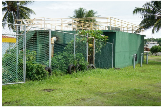
Figure 34. Imhoff tank structure containing two parallel units.