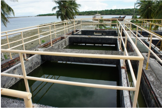
Figure 39. East-side Imhoff tank.