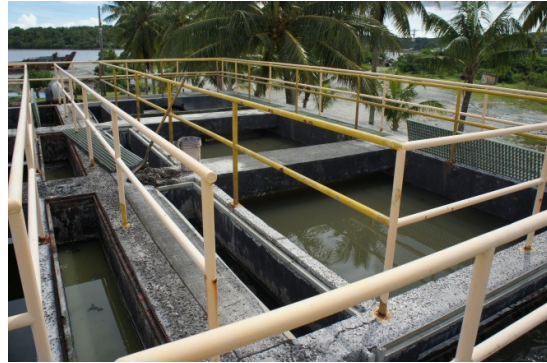
Figure 40. West-side Imhoff tank.