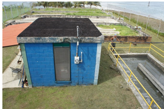
Figure 42. Chlorination unit building.