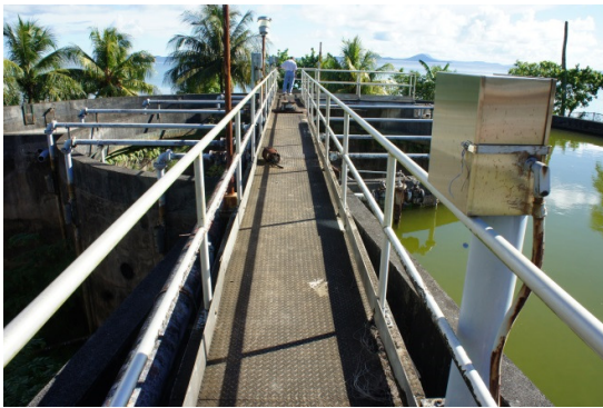
Figure 29. Walkway over treatment tanks.