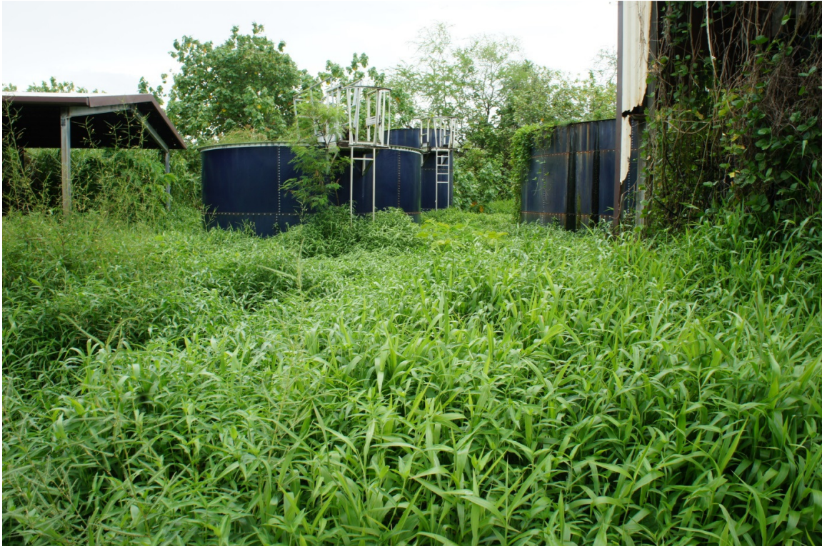
Figure 6. Inoperative industrial wastewater treatment plant of tuna packaging plant on Pohnpei.

Septic tanks on Pohnpei are typically constructed with an adjoining seepage pit rather than a leaching field and it is said that drawing excess sludge from the tanks is almost nonexistent – only one tank is serviced every 2 or 3 years – even though PUC does have a 1,000-gal pump truck for that purpose. The capital area in Pilikir Village is served by a very large septic tank (ca. 120,000 gal) with a footprint of approximately 20 ft by 40 ft and a leaching field said to extend about 100 yards. This facility appears to be intended for use by the government complex, though a lift-station has been installed to tie in nearby residences.