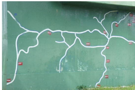
Figure 36. Map of sewer collection network showing lift stations (red squares).