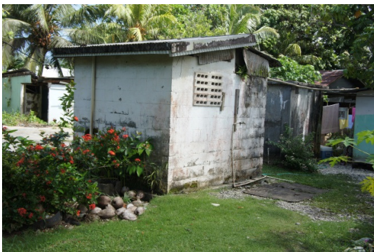
Figure 19. Typical outhouse with shower and toilet in Lelu Village.