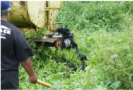
Figure 17. Pump truck unloading septic tank sludge into first oxidation pond.