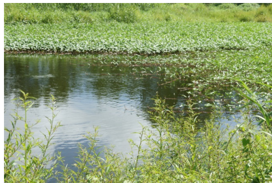
Figure 12. First oxidation pond, with natural aquatic plants.