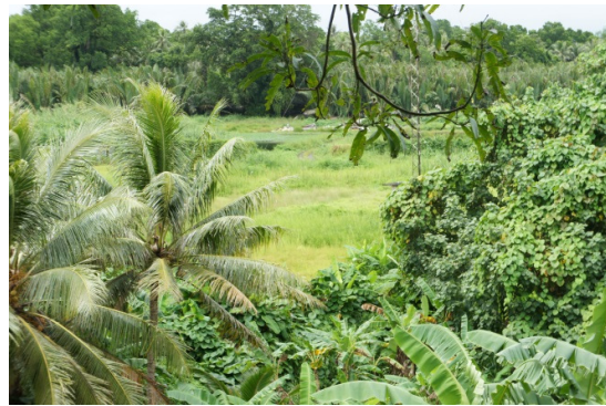
Figure 18. Oxidation pond area adjoining coastal mangrove.