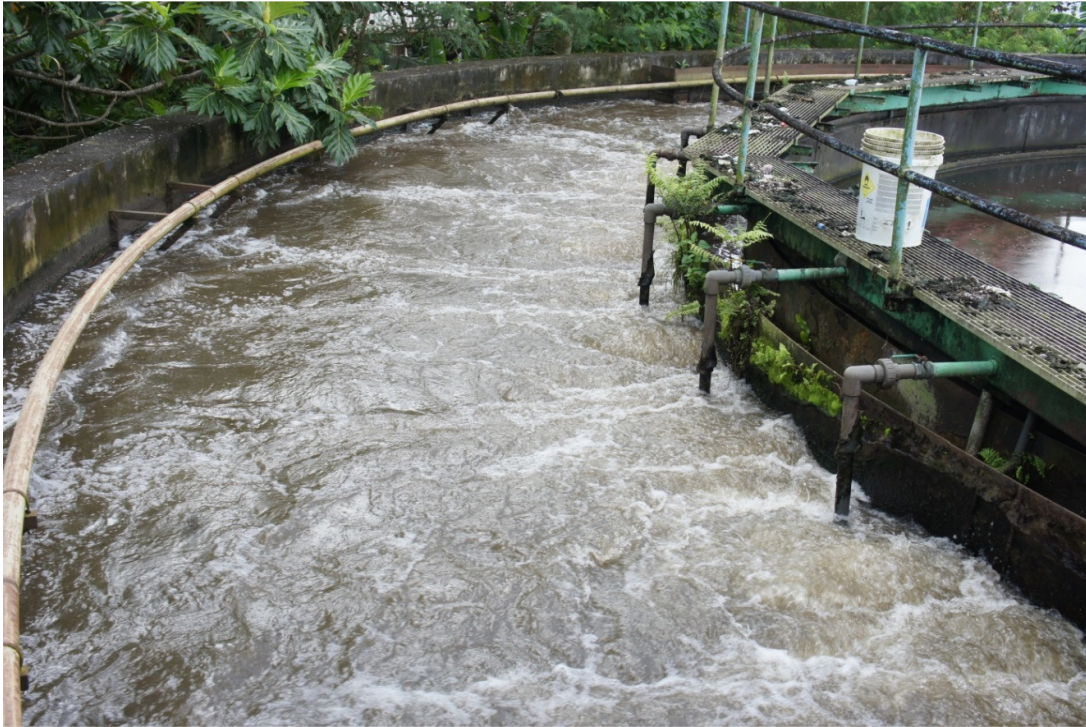
Figure 5. Contact-stabilization type activated-sludge wastewater treatment plant on Pohnpei.

Influent to the wastewater treatment plant reportedly does not include industrial wastewater, though it does have input from restaurants and kitchens and thus would include some fats, oils, and grease (FOG). However, there is a tuna packaging plant in the industrial zone near the airport with its own wastewater treatment plant that is currently inoperative (Figure 6). Ownership of that treatment plant is said to have been transferred to PUC about a decade ago, though the tuna packaging plant is still in operation and, apparently, discharging untreated industrial wastewater directly to the bay. Though not actively investigated in this study, it is known that there are a lot of piggeries on Pohnpei, from which runoff of swine waste into the bay (or elsewhere) is considered to be a significant problem. While there are said to be a couple of digesters for larger operations, the vast majority of this waste discharge appears to be going untreated.