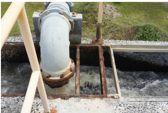
Figure 37. Raw sewage influent.