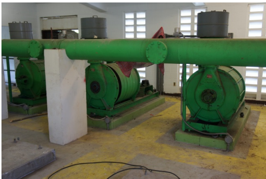
Figure 23. Blower room (aeration equipment) at wastewater treatment plant.