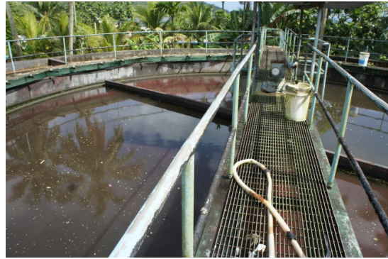
Figure 22. Sedimentation tank of wastewater treatment plant.