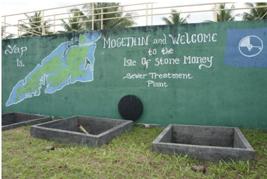
Figure 35. Island map on tank and sludge discharge valve pits (foreground).