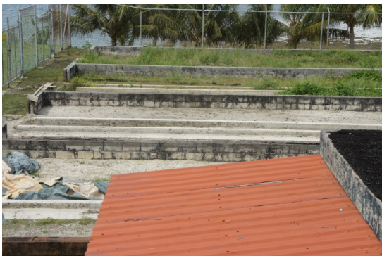
Figure 41. Sludge drying beds.