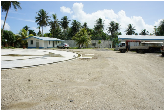
Figure 21. Wastewater treatment plant (center) and foundation of future plant (left).