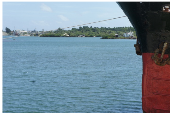
Figure 24. Outfall location for effluent discharge into Pohnpei Harbor.