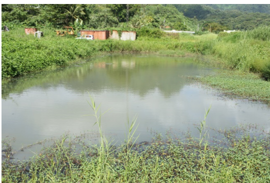
Figure 13. Second oxidation pond.