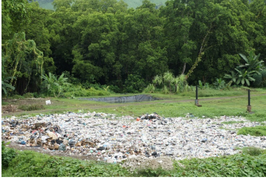
Figure 9. Landfill with leachate pond (between landfill and mangrove forest).