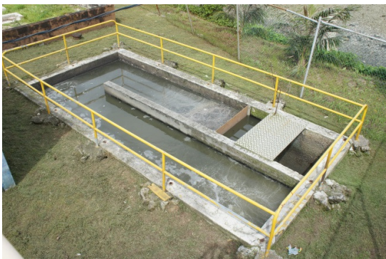
Figure 43. Chlorine contact chamber (not in operation).