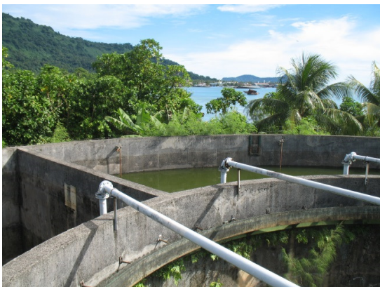
Figure 31. Bay view from wastewater treatment plant.