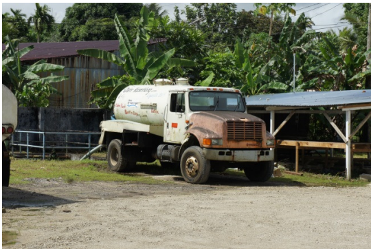
Figure 25. Pump truck for drawing sludge from septic tanks.