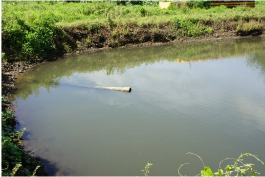
Figure 15. Exit/drain pipe from third pond.