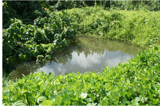
Figure 16. Small exit sampling pond.