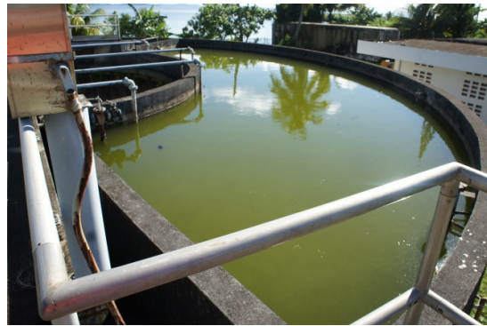
Figure 30. Rainwater in reactor tank.