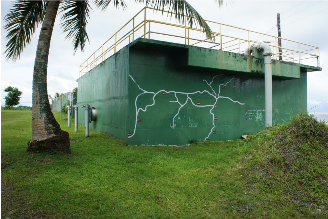
Figure 8. Imoff tank wastewater treatment plant in Colonia Village on Yap.