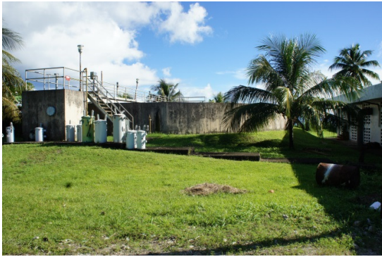
Figure 27. Inoperative wastewater treatment plant on Weno Island.