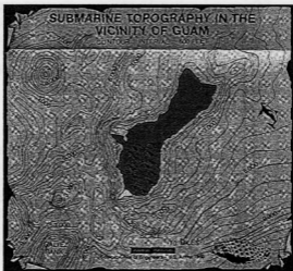
Figure 2.1. Relief map of Guam showing the physical characteristics of the Island including mountains, barrier reef (white area at southwest coast) and contours of adjacent ocean water depth (in feet).