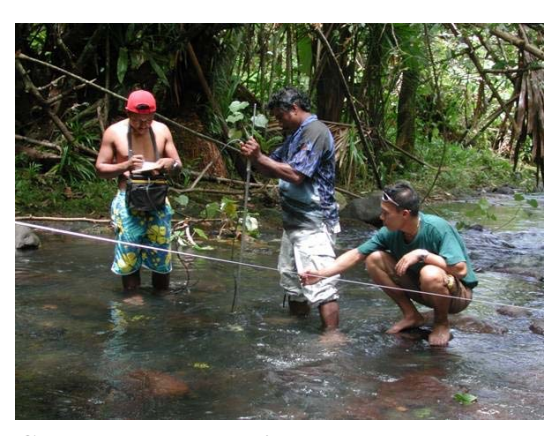
Graduate students in a WERI hydrology class calculate stream flow of a local river

professional employment in a variety of areas in the public and private sectors where an understanding of the complex interdisciplinary scientific, social, and political dimensions posed by environmental problems is increasingly necessary.