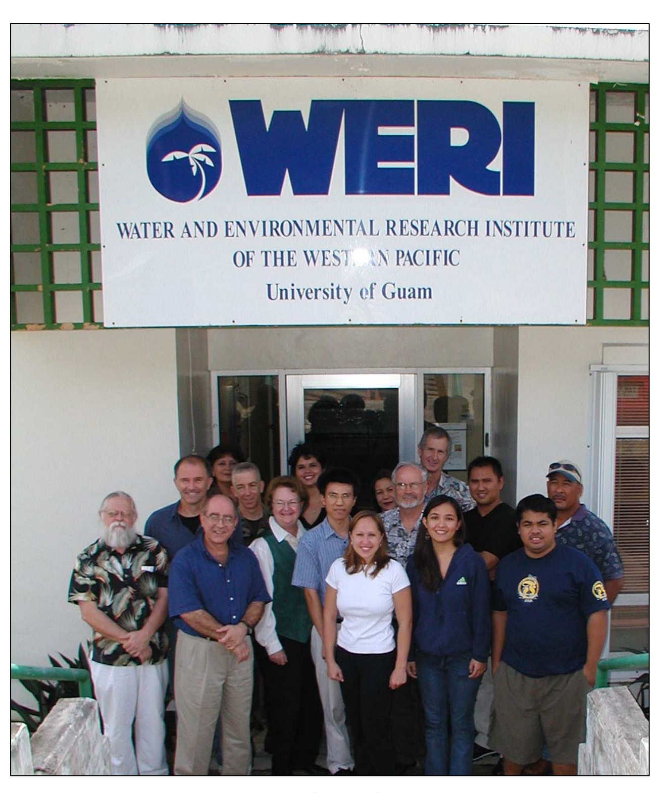
WERI Family and Friends