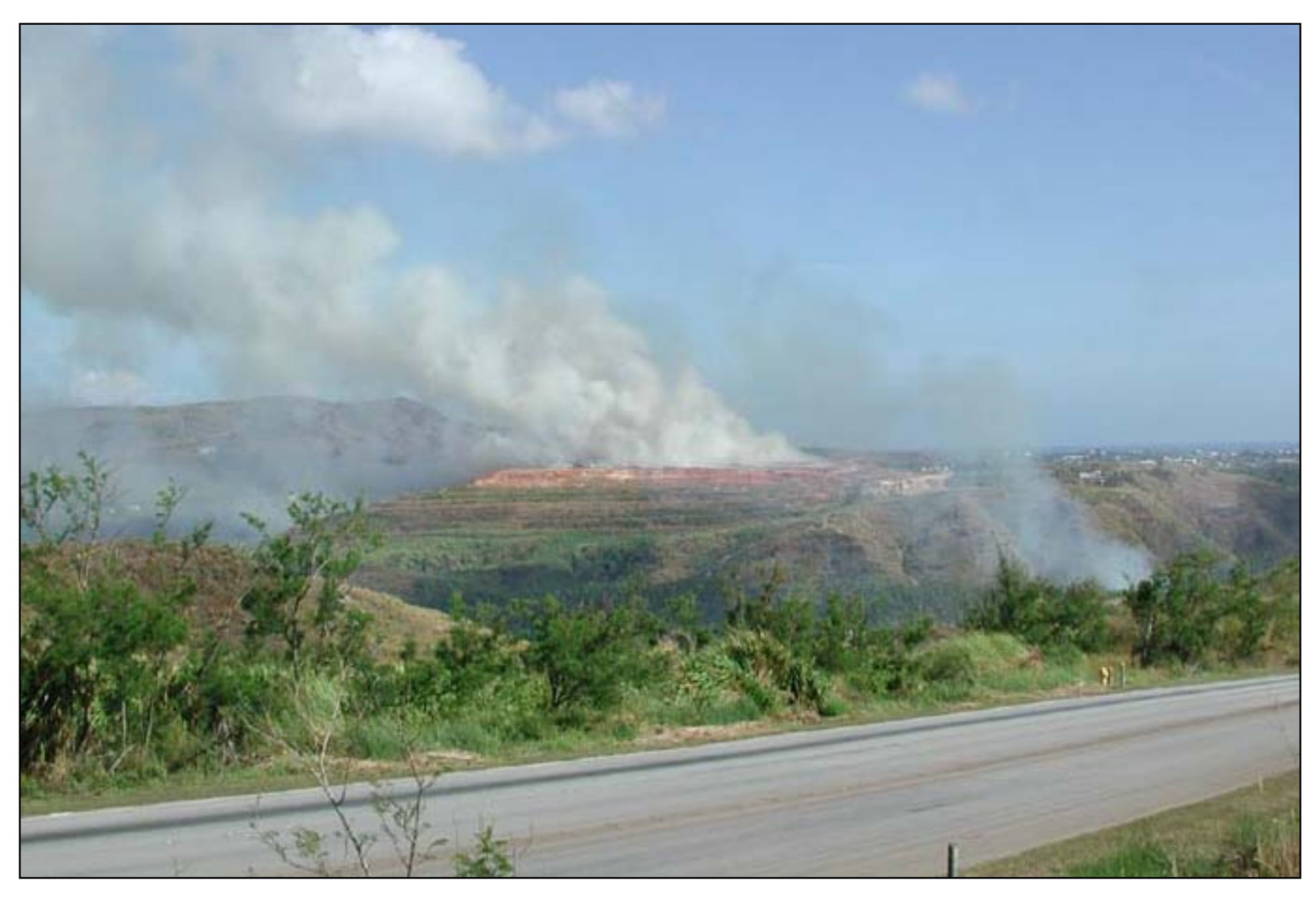
Guam's only civilian landfill in the village of Ordot continues to present challenging environmental and human health problems, some of which WERI scientists are investigating. One recently completed WERI study determined the impact of heavy metal contaminants in leachate streams discharged from the landfill on fisheries resources within the Pago River watershed and Pago Bay.