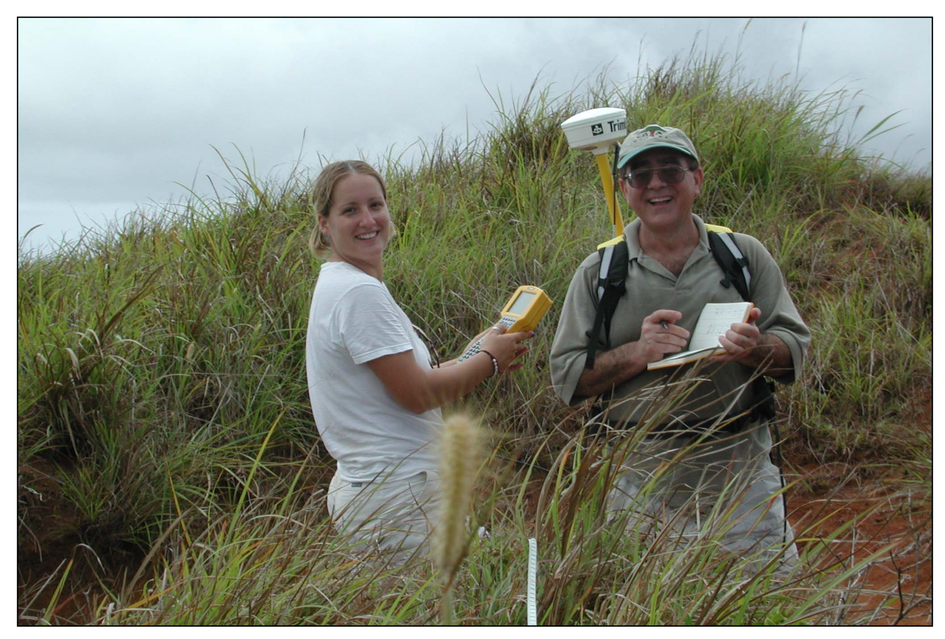
Mapping and modeling soil erosion in Guam's 'badlands' are vital aspects of watershed management that WERI scientists are actively involved with.