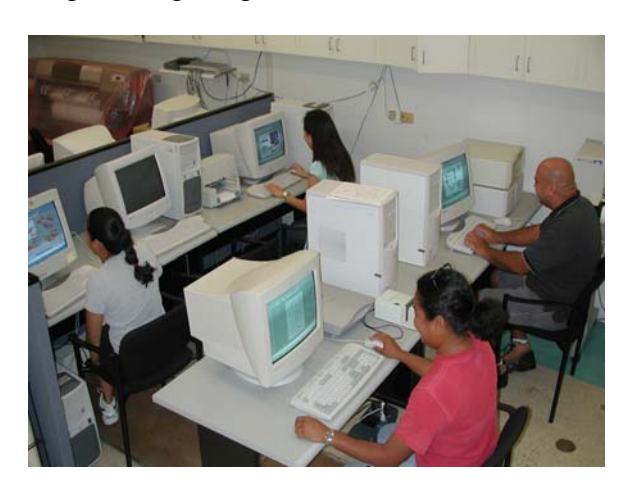
Students in WERI computer/GIS lab

Engineering requires a strong aptitude for both math and science. For students with these kinds of aptitudes but with weaknesses in prior training, there are remedial classes available to help bring the student up to a competitive level. These students will require more than the normal two years to complete the Pre-Engineering Program.